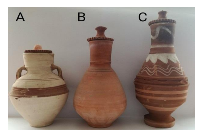
Fig. 2: Pottery jug (A), four of it purchased from Damietta Governorate; pottery jug (B) four of it purchased from El-Gharbia Governorate and Pottery jug (C), four of it purchased from El-Menya Governorate.